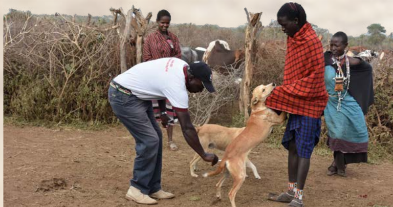
A dog owner restrains his dog as it gets vaccinated

Following the success of this campaign, KWT looks forward to working with partners to run similar campaigns.